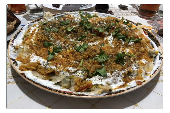
Aushak (leek and scallion dumplings)