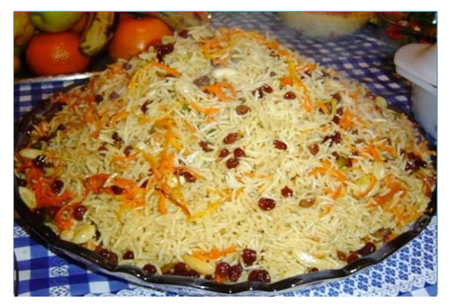
kabuli Pulao (steamed rice and lamb)