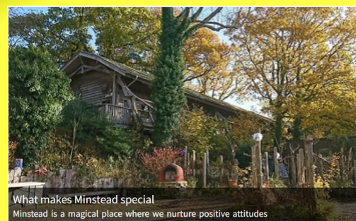
What makes Minstead special Minstead is a magical place where we nurture positive attitudes

If your child has been selected to attend the Minstead Residential, please could you make a non-refundable deposit of £30 to secure your child's place, if you haven't already. The cost of the residential will be payable in flexible instalments, as long as the full amount is paid by Friday 9 th June. If your child has been selected to go and can no longer attend, please let us know asap as we have children on a waiting list. Thank you.