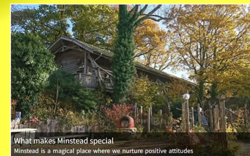
What makes Minstead special Minstead is a magical place where we nurture positive attitudes

If your child has been selected to attend the Minstead Residential, please could you make a non-refundable deposit of £30 to secure your child's place, if you haven't already. The cost of the residential will be payable in flexible instalments, as long as the full amount is paid by Friday 9 th June. If your child has been selected to go and can no longer attend, please let us know asap as we have children on a waiting list. Thank you.