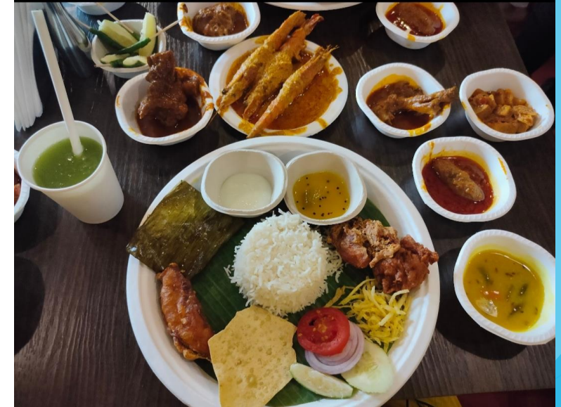
A traditional Bengali lunch, consisting of bhaat (rice), aloo bhaja (fried potato), begun bhaja (fried eggplant), dal (lentils), chingri machher malaikari (prawn), mutton, chatni, papad, and mishti.