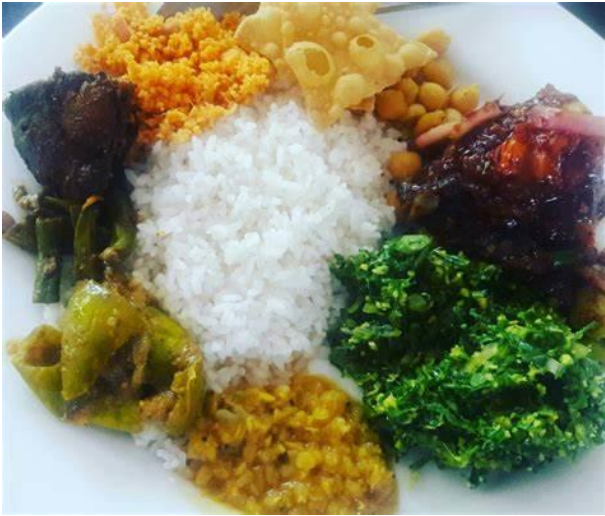
Curry and rice