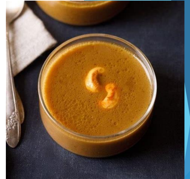
Jackfruit payasam (dessert)