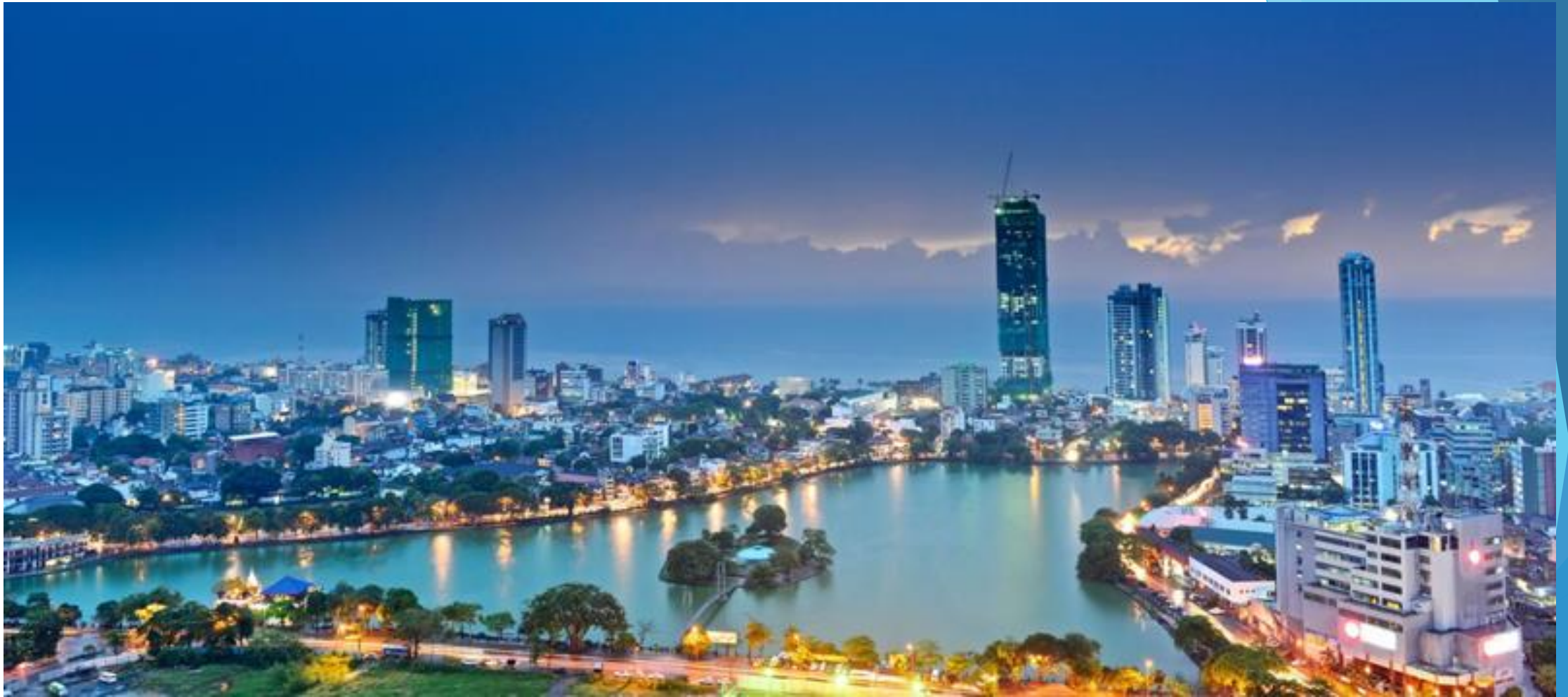
Sri Jayawardenepura Kotte – the capital city of Sri Lanka