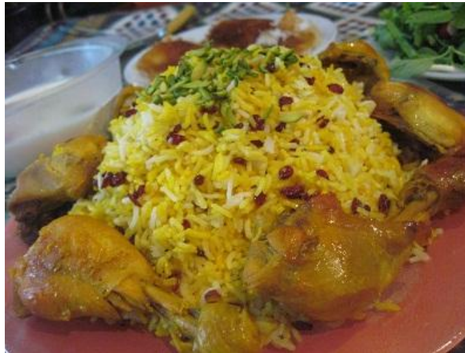
zereshk polo ba morgh