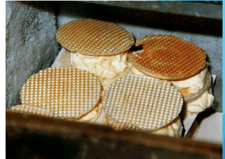
Bastani Nooni Sonnati