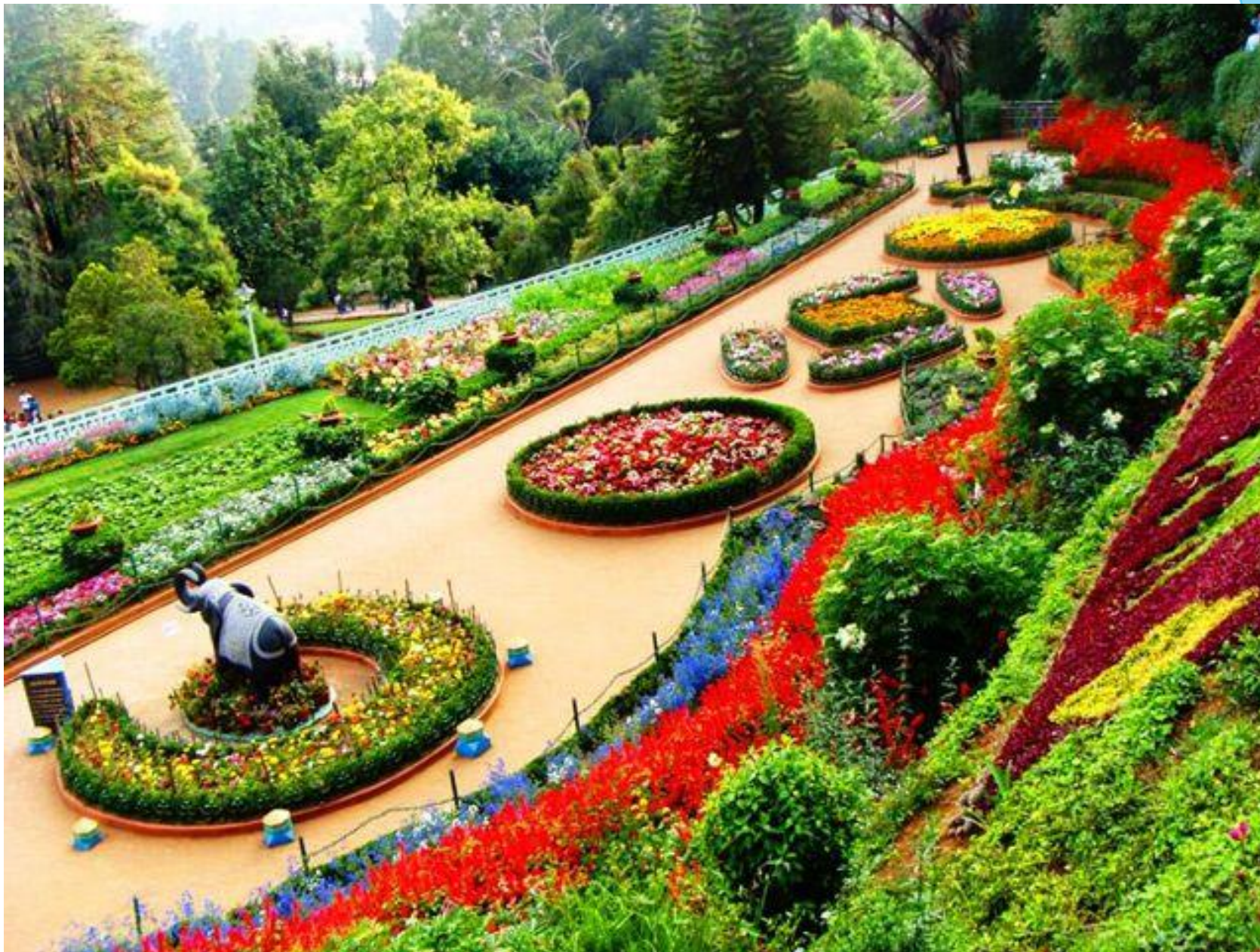
Ooty - The Botanical Gardens, a delight for all those who appreciate nature.