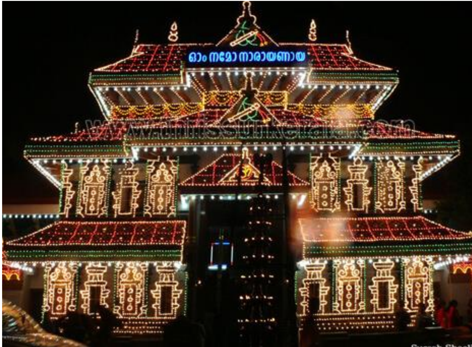
Guruvayur Sri Krishna Temple - the fourth largest Hindu temple in India.