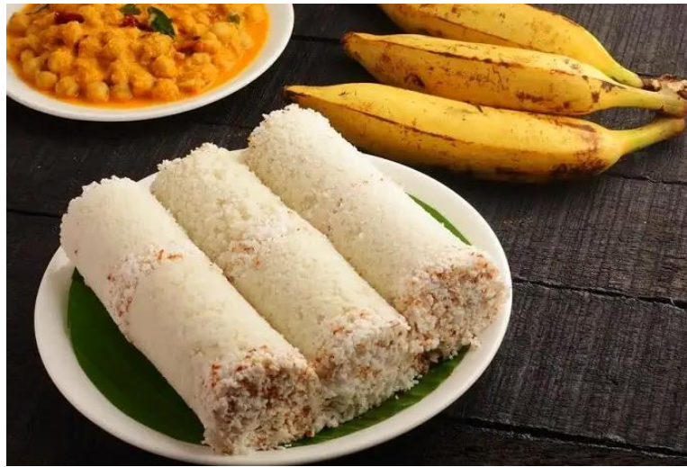
Puttu And Kadala Curry (often a morning snack made of rice, coconut and curry or bananas)