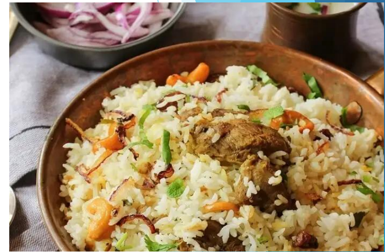
Thalassery Biryani (chicken, rice, peppers, spices)