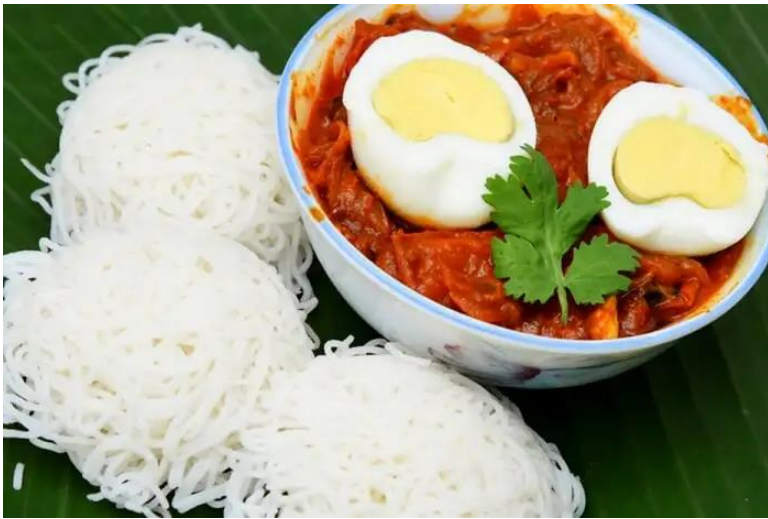
Idiyappam (egg curry)

Traditional Malayalam food and/or snacks